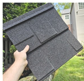
The Look of Shingles with the Strength of Steel!

Roof ventilation is a dangerous operation but very important for offensive firefighting. Try to work from an aerial ladder or tethered to a tower bucket whenever possible to help reduce the potential risks on the roof.