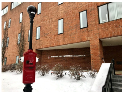
NFPA WORLD HEADQUARTERS IN QUINCY

A REMINDER TO CHECK THE MIFDI WEBSITE FOR MEETING CANCELLATIONS DURING THE WINTER MONTHS www.mifdi.org or on the MIFDI Facebook page