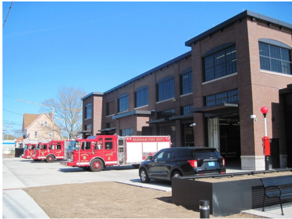
Dedham Public Safety Building

Stay safe and I hope to see you in Dedham on October 25.