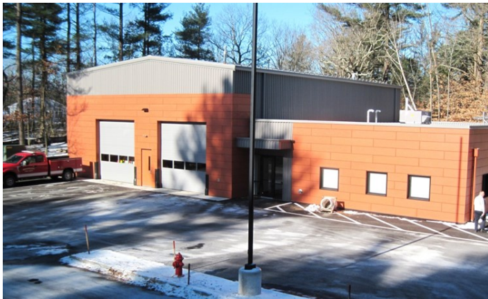
Brookline Training & Fleet Repair Facility

Stay safe and I hope to see you in Brookline on September 27.