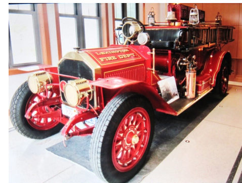
Lexington Hose & Chemical on display at Fire HQ