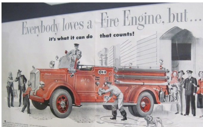
Old Mack Fire Apparatus ad from Fire Tech & Safety Training Room

Stay Safe and I hope to see you at Fire Tech on the 17 th