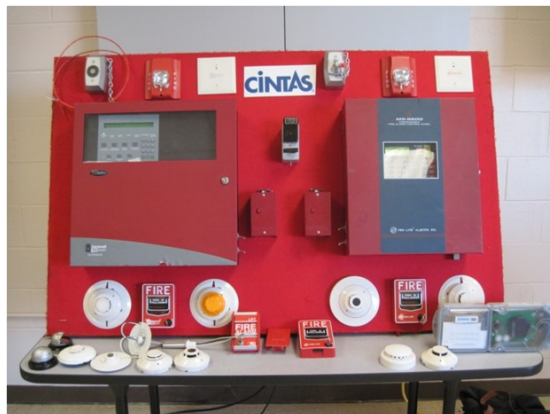
Cintas Fire training board

Stay Safe and I hope to see you at FireTech on the 18 th .