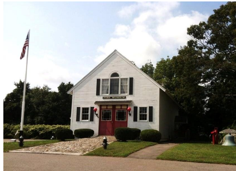
Brockton Fire Museum at the Brockton Historical Society

From Rt. 128 /I-93, take Rt. 24 South. Turn off at Exit 18 to Rt.27 towards Stoughton. At the first traffic light, the museum will be directly in front of you. There is plenty of free parking on site.