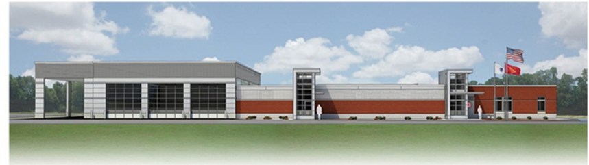
DFS Springfield FIRE TRAINING ACADEMY Front Facade View