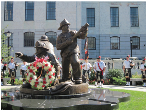
Massachusetts Fallen Fighters Memorial