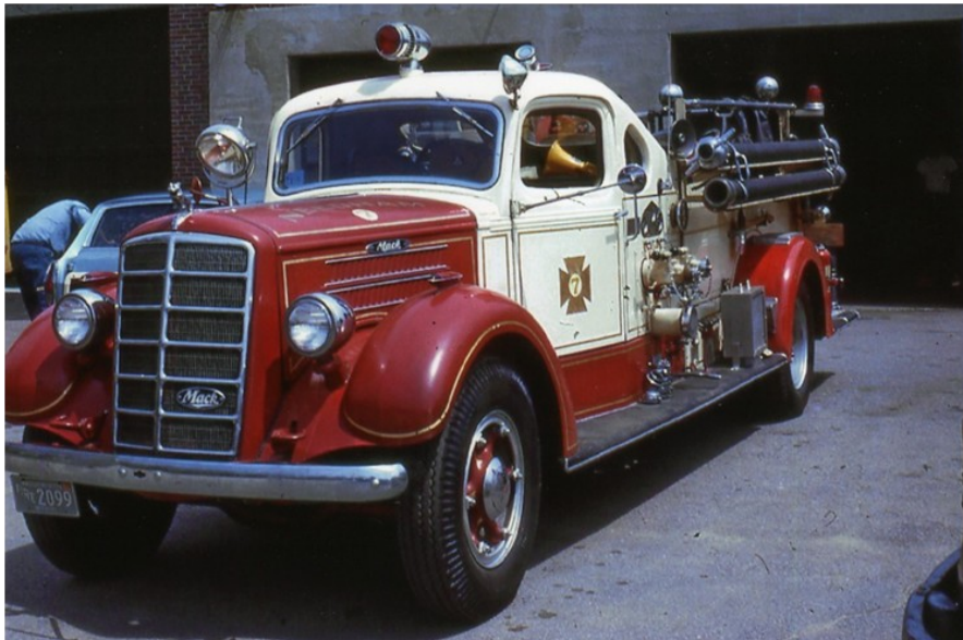
Vintage Mack pumper from Needham

Stay Safe and I hope to see you in Needham on the 24 th