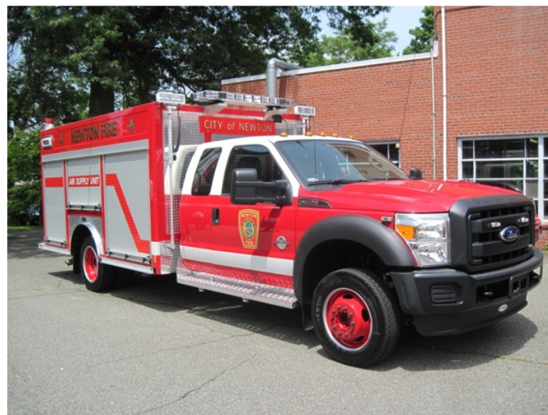
MIFDI members were provided a tour of Newton's new Air Supply Unit

Members adjourned for lunch nearby at West Street Tavern.