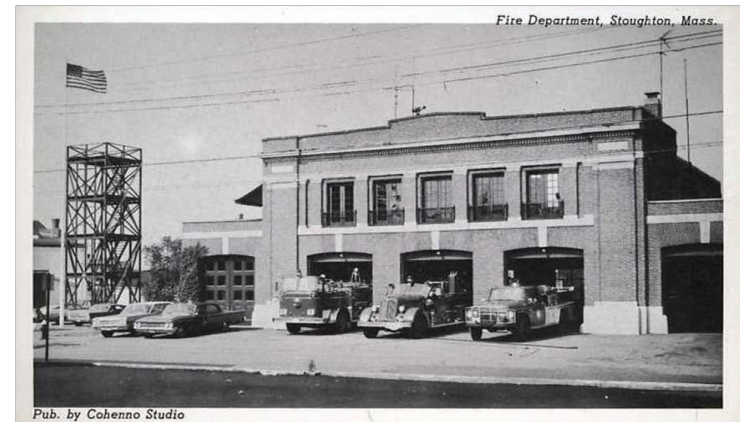
Vintage Stoughton Post Card from the 1960's. Note the old training prop of the left.

From Rt.128 (I 93/I 95), take Exit 2A, Rt. 138 South. Follow 138 south approx 5-miles to Central St. (CVS on the corner). Turn right on Central St. and travel approx 1-mile. The fire station is on the left just past the railroad tracks.