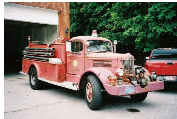
Engine 3 is the oldest 'in-service' piece at the Merrimac Fire Department. It is used primarily for brush and grass fires, supplementing Forestry 35, a 2003 GMC one ton brush truck.

Members adjourned for lunch at the Sylvan Street Grill in nearby Salisbury.