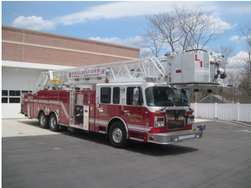
Chelmsford Fire Department new Tower-Ladder 1

Stay Safe and I hope to see you in Merrimac on the 27 th .