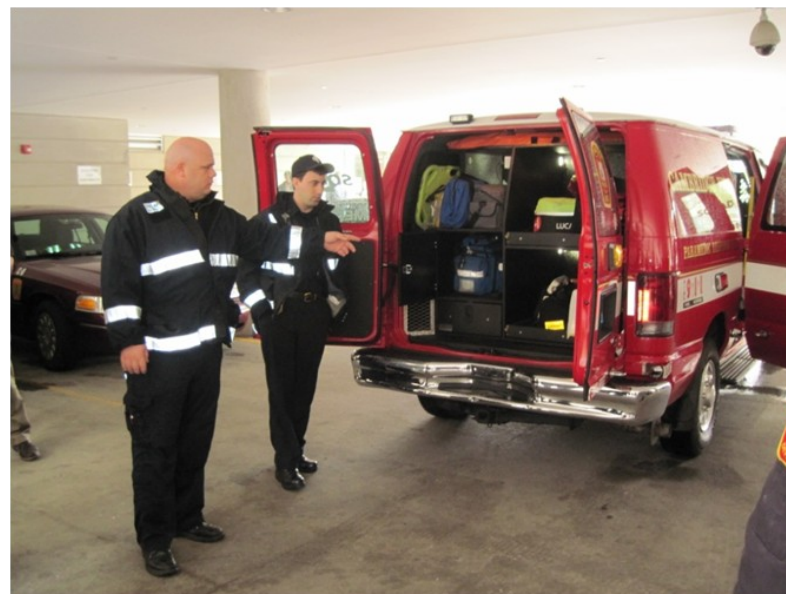
MIFDI members were provided a tour of Cambridge Paramedic Squad 4

Members adjourned for lunch nearby at Bertucci's at Fresh Pond.