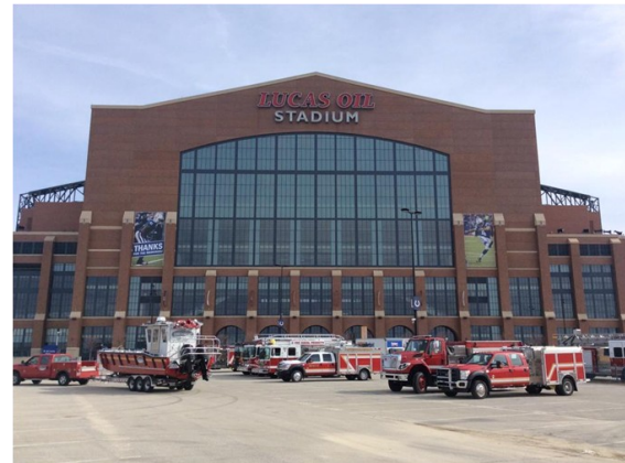
F.D.I.C. Exhibit Hall, Downtown Indianapolis.

0900 Coffee, 1000 Presentation, 1130 Business Meeting, 1200 Lunch (Off site)