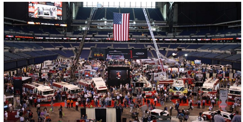
F.D.I.C. Exhibit Hall, Downtown Indianapolis

0900 Coffee , 1000 Presentation, 1130 Business Meeting, 1200 Lunch (Off site)