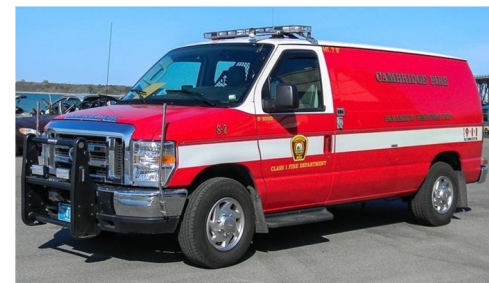
Cambridge Fire Department Medic Squad

From Rt.128/I 95, take Rt.2 EAST to Rt.16 WEST. Follow Rt.16 WEST for 1.5-miles. When Rt.16 turns left on Aberdeen Ave., continue straight instead onto Huron Ave. The VFW Post will be on the left just before the 20-story Parkside Place Apartments. There is on-street parking along both sides of Huron Ave.