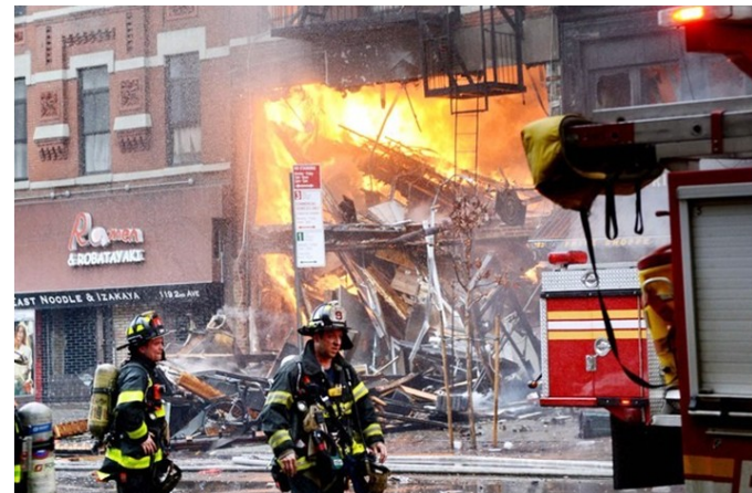
The result of a catastrophic gas explosion in New York City

DIRECTIONS: From Rt. 495, take Exit 23B to Rt. 9 West. Continue Rt. 9 West approx 7-miles to Rt. 140 North toward Shrewsbury (Staples on corner). Continue North on Rt. 140, which is Grafton St., for approx 1-mile. When you cross the lights at Main St., take the very first left on Church Rd. at the white wooden church and you will see the station in front of you. There is plenty of parking to the right of the station. We will meet in the first floor training room.