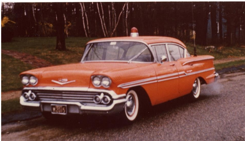
Vintage 1958 Chevrolet Chief's car from Wakefield

Stay Safe and I hope to see you in Wakefield on the 25 th .