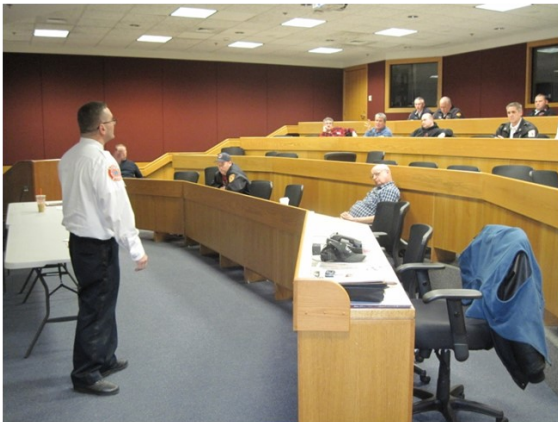
Natick Chief offers greetings January meet-

Stay Safe and I hope to see you in Wilmington on the 27th.