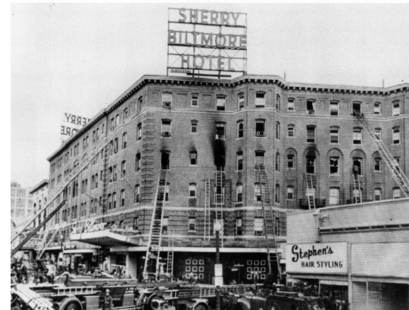
Sherry-Biltmore Hotel Fire, March 29, 1963. 146 Massachusetts Avenue, Back Bay, 5 Alarms, Box 2321, 0400 Hours. 27 injured, 4 fatalities, over 100 persons rescued over ladders, 51 aerial & ground ladders used.

From Rt.128, take Exit 20A (Rt.9 EAST). Follow Rt.9 approx 6-traffic lights (3.4 miles). Turn right at the 6 th light onto Hammond St. (former gas station on corner). Follow Hammond St .08 miles and the firehouse will be on the left. Turn into the driveway on the D-Side of the station to the rear drill yard where there is plenty of parking.