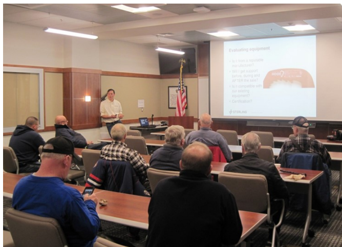
Bail-Out System Presentation in Sharon

Stay safe, I hope to see you in Waltham on November 28.