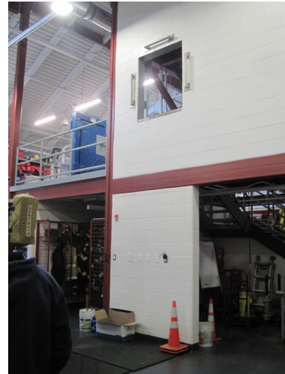
INDOOR TRAINING PROP AT SHARON FIRE

Members adjoined for lunch at Mick Morgan's in Sharon.