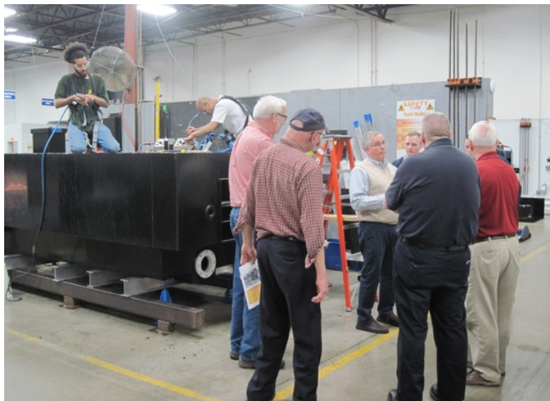
UPF FACTORY TOUR

Stay safe, I hope to see you at the Academy on March 28.