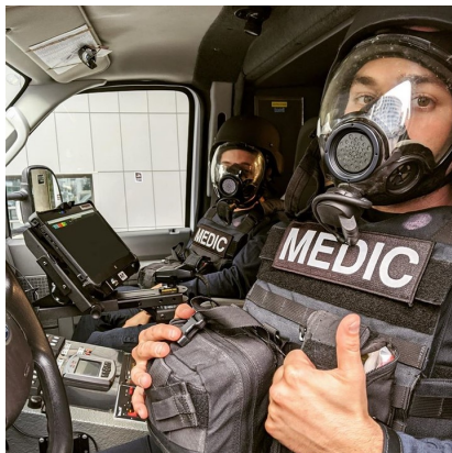
EMS in Denver with Covid-19 protection as well as Ballistic PPE protection

Be vigilant and do not become a patient. Stay strong and focused on our life-saving mission.